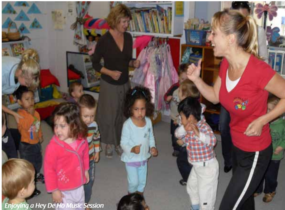
Enjoying a Hey De Ho Music Session