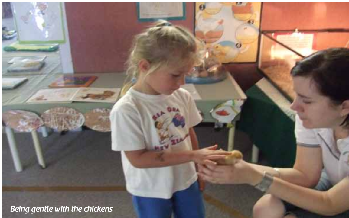
Being gentle with the chickens